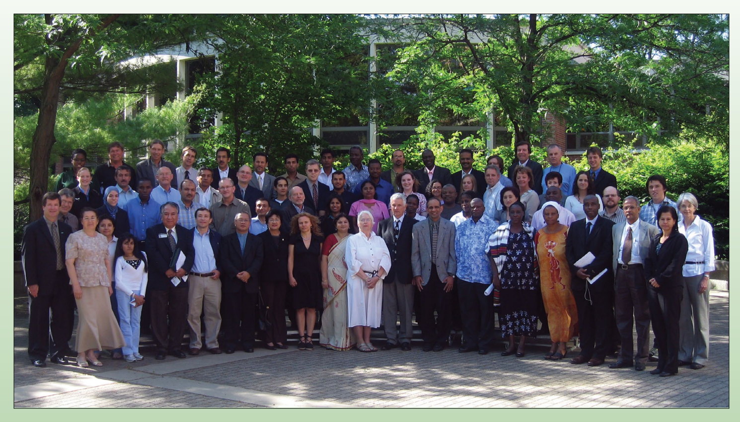
Global Integrated Pest Management (IPM) Forum